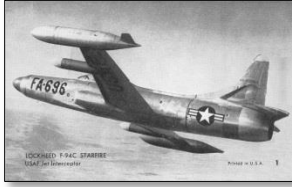
Typical W452-1 Card Front

American Card Catalog Number: ..... W452-1 Series Title: ..... Planes, Series 1 (aka "Jet Planes"; "Printed in U.S.A.") Manufacturer: ..... Exhibit Supply Company, Chicago, IL Card Type: ..... Vending Machine Card Dimensions (measured): ..... 3.31 x 5.31 inches (130 x 209 mm) Number of Cards in Set: ..... 64 Card Numbers: ..... 1 to 64 Country of Origin: ..... United States of America Circa: ..... 1955