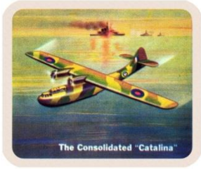
Typical V407 Card Front

American Card Catalog No.: ..... V407 Title: ..... United Nations Battle Planes Manufacturer: ..... Cracker Jack Co. Card Dimensions: ..... 3.06 x 2.56 inches Number of Cards: ..... 50 (V407-1); 98 (V407-2); 147 (V407-3) Numbering: ..... 1-50; 1-98; 1-147 on reverse Circa: ..... Late 1930s to early 1940s Country of Origin: ..... Canada Album: ..... None known