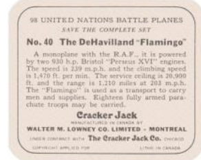
Type 2 Back