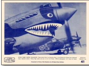
Typical Card Front

American Card Catalog Number: ..... UO33 Series Title: ..... Hi-Speed Victory Club War Album Series Manufacturer: ..... Hi-Speed Gasoline Stations Card Type: ..... Gasoline Issue Card Dimensions: ..... 160 x 216 mm Number of Cards in Set: ..... 50 cards Card Numbers: ..... 1 to 50 Country of Origin: ..... United States of America Circa: ..... 1942 Album: ..... Victory Club Album – Official Government Photographs