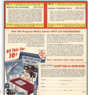
2-Card Panel Back