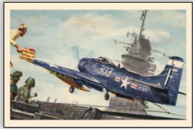
Typical Card Front

Set Title: ..... Historic Collectors' Cards – 50 th Anniversary of Naval Flight Issued by: ..... Revell, Inc., Venice, California, USA American Card Catalog Number: ..... UM26-6 Year issued: ..... 1960 Packaged with: ..... Revell's "Famous Artist Series" Number of cards: ..... 24+1 error card Numbering: ..... 1 to 24 on reverse Card dimensions (nominal): ..... 3.89 x 2.58 inches (98.89 x 65.53 mm)