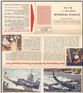
2-Card Panel Front