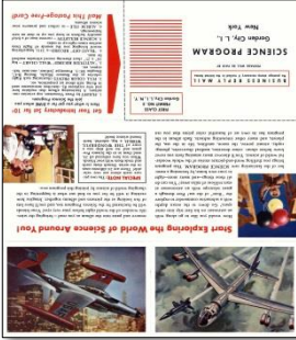
2-Card Panel Front

Set Title: ..... Historic Collectors’ Cards – The Air Power Series Issued by: ..... Revell, Inc., Venice, California, USA American Card Catalog Number: ..... UM26-5 Year issued: ..... 1961 Packaged with: ..... Revell’s “Air Power Series” Number of cards: ..... 12 Numbering: ..... 1 to 12 on reverse Card dimensions (nominal measured): ..... 97.16 x 63.80 mm