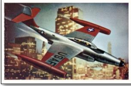
Typical Card Front