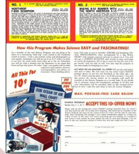
2-Card Panel Back