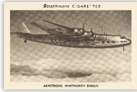
Typical Card Front

Cartophilic Reference Number: ..... S128-1 Series Title: ..... British Aircraft Manufacturer: ..... Strathmore Tobacco Co. Ltd. Packaged with: ..... Strathmore Cigarettes Card Dimensions: ..... 76 x 50 mm Number of Cards in Set: ..... 25 Card Numbers: ..... 1 – 25 Country of Origin: ..... United Kingdom Issue Date: ..... 1938 Album: ..... Unknown