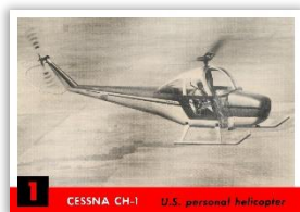
Typical R707-1 Card Front

Set Title: ..... “Jets” Issued by: ..... Topps Chewing Gum Cartophilic reference number: ..... R707-1 Packaged with: ..... Jets Photo Album Bubble Gum Year issued: ..... 1956 Number of cards: ..... 240 Numbering: ..... 1-240 Card dimensions: ..... 52 x 75 mm Album: ..... Yes