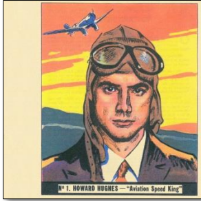
Typical R65 Card Front

American Card Catalog Number: ..... R65 Series Title: ..... History of Aviation Series Manufacturer: ..... Goudey Gum Company Card Type: ..... Gum Issue Card Dimensions: ..... 5½ x 5½ inches (139.7 x 139.7 mm) Number of Cards in Set: ..... 10 cards Card Numbers: ..... 1 to 10 Country of Origin: ..... United States of America Circa: ..... 1936