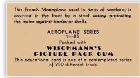
Typical R5 Card Back

Set Title: ..... "Aeroplane Series" Issued by: ..... Wm. J. Wischmann Co. Cartophilic reference number: ..... R5 Packaged with: ..... Wischmann's Picture pack Gum Year issued: ..... 1933 Number of cards: ..... 25 Numbering: ..... unnumbered Card dimensions: ..... 63.5 x 34.9 mm Album: ..... No