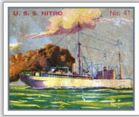
Typical R20 Card Front

American Card Catalog No.: ..... R20 Title: ..... Battleship Gum Manufacturer: ..... Newport Products Company Card Dimensions: ..... 2-3/8" x 2-7/8" Number of Cards/ Numbering: ..... 50 Cards, numbered 1 to 50 Circa: ..... Late 1930s Country of Origin: ..... United States of America