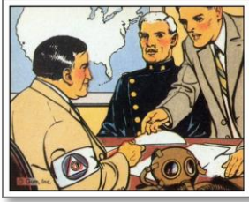
Typical R158 1984 Reprint Card Front

American Card Catalog No.: ..... R158 Reprint Title: ..... Uncle Sam’s Home Defense Manufacturer: ..... WTW Productions Card Dimensions: ..... 2 1/2 x 3 1/8 inches Number of Cards: ..... 48 Numbering: ..... 97 to 144 on reverse Circa: ..... 1984 Country of Origin: ..... United States of America Album: ..... None known