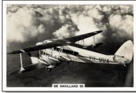
Typical Card Front