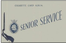
Generic SENIOR SERVICE Album

Cartophilic reference Number: ..... P18-68-B Series Title: ..... Flying Manufacturer: ..... Joseph A. Pattrieux, Ltd. Packaged with: ..... SENIOR SERVICE Cigarettes Card Dimensions (measured): ..... 77.47 x 52.07 mm Number of Cards in Set: ..... 48 Card Numbers: ..... 1 – 48 on reverse Country of Origin: ..... Manchester, England Circa: ..... 1938 Album: ..... Generic SENIOR SERVICE Cigarette Card Album