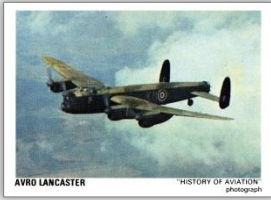
Typical "History of Aviation" Card Front

Series Title: ..... History of Aviation Manufacturer: ..... Nabisco Foods, Ltd. British Trade Index No.: ..... NAB-5 Card Type: ..... Food Insert Card Dimensions (measured): ..... 77.05 x 55.46 mm Number of Cards in Set: ..... 10 Card Numbers: ..... 1 to 10 on reverse Country of Origin: Welwyn Garden City, Herts, England, UK Circa: ..... 1970