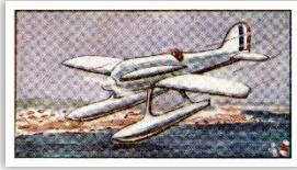
Typical M164-46 Card Front

Set Title: ..... “Types of Aeroplanes” Issued by: ..... Murray Sons & Co., Ltd. World Tobacco Index: ..... M164-46 Country of origin: ..... Northern Ireland (UK) Year issued: ..... 1929 Type of card: ..... Tobacco card Number of cards: ..... 25 Numbering: ..... 1 to 25 on reverse Card dimensions: ..... 66 x 36 mm