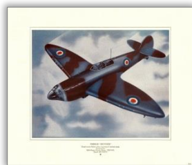
Typical FC13 Card Front

Series Title: ..... Britain's Fighting Planes and Warships of the British Navy Manufacturer:..... The Canada Starch Co. Limited American Card Catalog: ..... FC13 Card Type: ..... Mail Order Food Issue Card Dimensions (measured): ..... 10.00 x 8.48 inches Photo Card Dimensions (measured): ..... 7.38 x 5.77 inches Number of Cards in Set: ..... 30 (29 numbered, 1 unnumbered) Card Numbers: ..... 213 to 241 plus one unnumbered Country of Origin: ..... Montréal - Toronto, Canada Circa: ..... 1941-1942