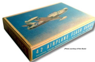
“42 Airplane Flash Cards” Box-Pack

[E] & [*] Error and typo cards, see webpage for details.