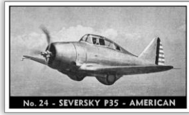
Typical DO6-8 Card Front