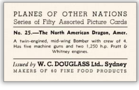
Typical DO6-8 White Card Back