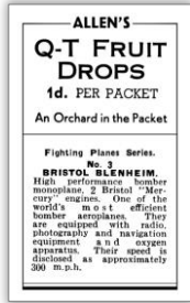
Q-T Fruit Drops Back