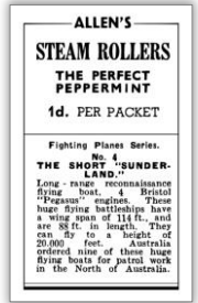
Steam Rollers Back