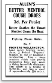
Butter Menthol Cough Drops Back