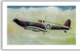
Typical Card Front

Series Title: ..... Fighting Planes Series Manufacturer: ..... Allen's Confectionary, Ltd. Packaged with: ..... Irish Moss Gum Jubes Butter Menthol Cough Drops Q-T Fruit Drops Steam Rollers Card Type: ..... Confectionary Insert Issue Card Dimensions (measured): ..... 65.70 x 40.30 mm Number of Cards in Set: ..... 36 (9 cards per product) Card Numbers: ..... 1 to 36 Country of Origin: ..... Melbourne, Australia Circa: ..... 1943