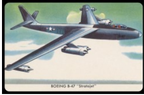
Typical F279-18 Card Front

Quaker Pack-O-Ten "Warplane" Cards American Card Catalog No.: ..... F279-18 Set Title: ..... Quaker Pack-O-Ten Warplane Cards Manufacturer: ..... The Quaker Oaks Company, Chicago, IL Card Size: ..... 2¼ x 3½ inches (PLC with rounded corners) Number of cards: ... 27 "text", 27 "plain" & 4 "sample" cards Circa: ..... 1957