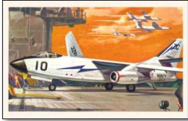
Typical Card Front

Set Title: ..... Historic Collectors’ Cards – Development of Naval Flight Issued by: ..... Revell, Inc., Venice, California, USA American Card Catalog Number: ..... UM26-4 Year issued: ..... 1961 Packaged with: ..... Revell’s “Famous Aircraft Series” Number of cards: ..... 24 Numbering: ..... 1 to 24 on reverse Card dimensions (nominal): ..... 3.93 x 2.51 inches (99.74 x 63.67 mm)