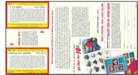
2-Card Panel Back