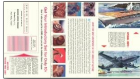
2-Card Panel Front