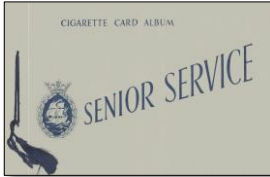
Generic SENIOR SERVICE Album