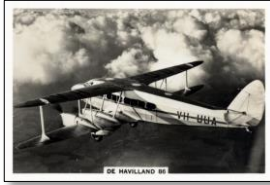
Typical Card Front