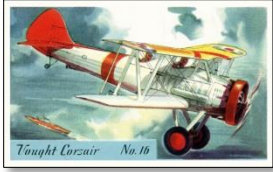
Typical Card Front

Set Title: ..... Famous Airplane Pictures, Series 2 Issued by: ..... H. J. Heinz Company, Pittsburg, PA American Card Catalog Number: ..... F277-1 Country of origin: ..... USA Year issued: ..... 1935 to 1939 Issued via: ..... Heinz Rice Flakes & Heinz Breakfast Wheat Type of card: ..... Food Issue Number of cards: ..... 7 x 25 Numbering: ..... 1 to 25 both sides Card dimensions: ..... 1-7/8 x 3 inches