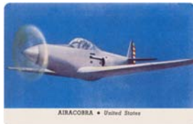
AIRACOBRA • United States